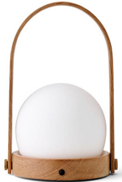
Shown in: Natural Oak / Opal

The Carrie Portable Lamp Exclusive Oak Edition is designed to honor Hygge, a way of life in Denmark where the winters are long and cold. This piece can be used in a variety of settings, as well as an alternative to candle light. With a sleek, functional handle and a warm orb of light nestled gently in a basket-like base, the lamp is useful almost anywhere - even on the go. A button on the base allows you to cycle through the three light intensities. Includes a detachable handle, USB to micro-USB charging cable and power outlet adapter. Lamp shade is removable.