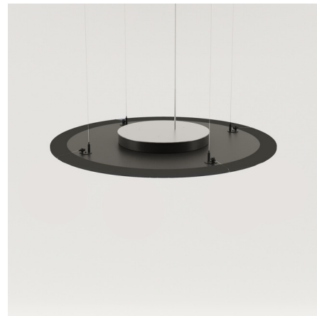
Shown in white / satin

The Circus Acoustic Panel Light is a LED module with indirect light designed for use with the Circus 38 inch and 58.25 inch Acoustic Panels. Satin aluminum structure with satin PMMA diffuser. Note: Shown with Acoustic Panel, sold separately.