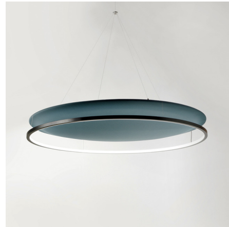
Shown in black poly / matte black

The Circus Acoustic Panel Pendant brings both form and function to your interior space. The minimalist light is complemented by a honeycomb polycarbonate acoustic panel with a removable 100% polyester 3D fabric cover offered in White, Beige, or Black. This panel helps the acoustics and diffuse the light in your area.