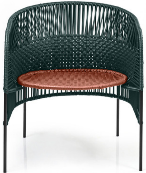
Shown in: Black / Moss Green Backrest/ Copper Seat

The Caribe Chic Lounge Chair is an elegant design by Sebastian Herkner and can be used inside and outdoors. It's part of our Caribe Chic collection, featuring an intricate hand-woven webbing in contrasting earthy, muted shades. The pieces and colors are inspired by the incredible nature of the Colombian Huila region where the serene Tatacoa desert meets the powerful Rio Magdalena.