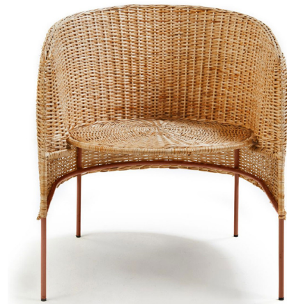
Shown in copper / natural

The Caribe Natural Lounge Chair is a design by Sebastian Herkner, featuring a beautiful wicker webbing. The shape of the table follows our popular Caribe and Caribe Chic pieces, while the beige hue of the natural material gives it a more subtle touch. The wicker lends the design a natural look and makes it very comfortable to sit in.