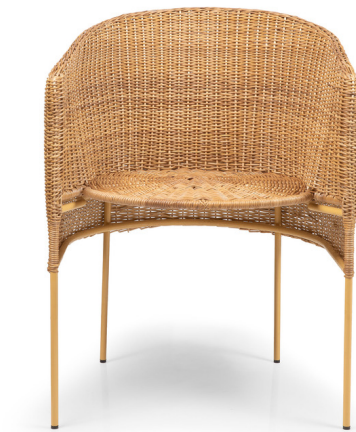
Shown in yellow / natural

PRODUCT DIMENSIONS . . . . . Seat Height: 17.72"