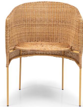
Shown in yellow / natural

The Caribe Natural Dining Chair is a design by Sebastian Herkner, featuring a beautiful wicker webbing. The shape of the chair follows our popular Caribe and Caribe Chic pieces, while the beige hue of the natural material gives it a more subtle touch. The wicker lends the design a natural look and makes it very comfortable to sit in. For indoor use.