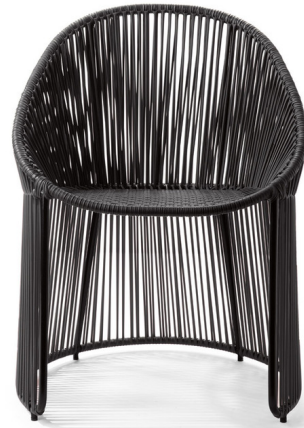
Shown in black / black / black

The colors and shape of the Cartagenas Dining Chair are inspired by Sebastian Herkner's visit to Colombia's buzzing coastal city Cartagena de Indias. Fishing pelicans, women selling fruit, cozy restaurants: Cartagena lures you in with its many facets and this collection also plays with perspectives, describes Sebastian the collection. The elegant, curved chair can be used indoors and outdoors and comes either with a seat and back in contrasting colors or a monochrome version.