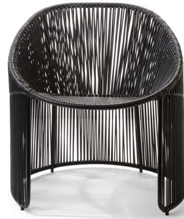
Shown in black / black / black

The colors and shape of the Cartagenas Lounge Chair are inspired by Sebastian Herkner's visit to Colombia's buzzing coastal city Cartagena de Indias. Fishing pelicans, women selling fruit, cozy restaurants: Cartagena lures you in with its many facets and this collection also plays with perspectives, describes Sebastian the collection. The elegant, curved chair can be used indoors and outdoors and comes either with a seat and back in contrasting colors or a monochrome version.