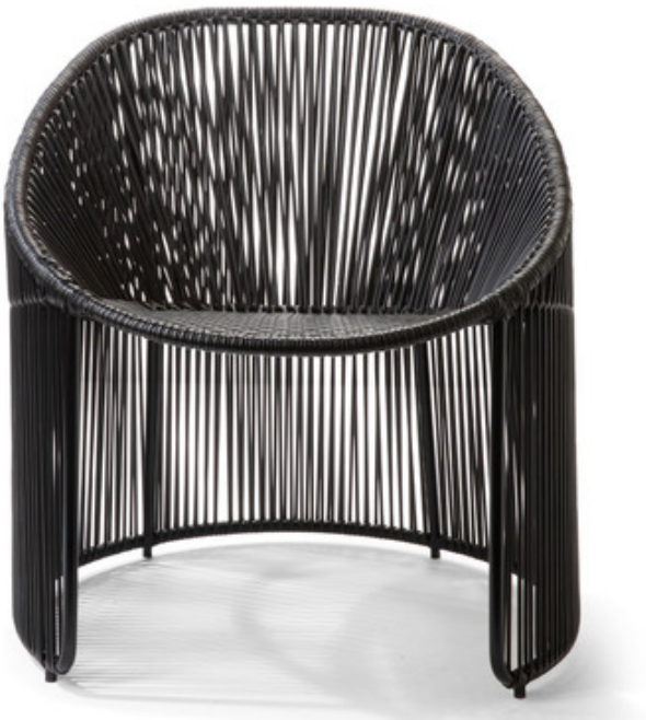
Shown in: Black / Black/ Black

The colors and shape of the Cartagenas Lounge Chair are inspired by Sebastian Herkner's visit to Colombia's buzzing coastal city Cartagena de Indias. Fishing pelicans, women selling fruit, cozy restaurants: Cartagena lures you in with its many facets and this collection also plays with perspectives, describes Sebastian the collection. The elegant, curved chair can be used indoors and outdoors and comes either with a seat and back in contrasting colors or a monochrome version.