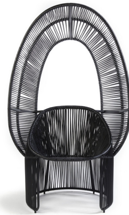
Shown in black / black / black

PRODUCT DIMENSIONS . . . . . Seat Height: 16.93"