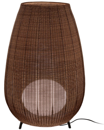
Shown in brown / rattan brown

COLOR RENDERING . . . . . 90 CRI LAMP COLOR . . . . . 2700K LUMENS/WATT . . . . . 121.46 LUMINOUS FLUX . . . . . 3000 lumens