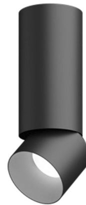
Shown in black / black

LAMP LIFE . . . . . 50000 hours BEAM ANGLE . . . . . 18° COLOR RENDERING . . . . . 90 CRI LAMP COLOR . . . . . 2700K LUMENS/WATT . . . . . 116.67 LUMINOUS FLUX . . . . . 1400 lumens