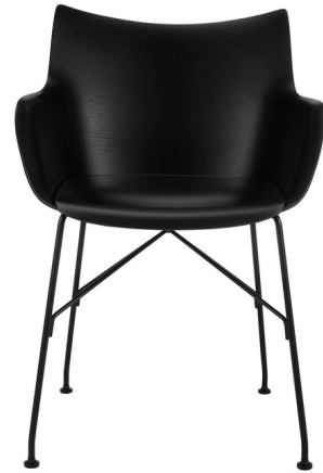
Shown in black / black wood veneer / black

The Q/Wood Armchair is a simple piece that will work in a variety of settings. The curved, molded seat with sides rests atop a steel frame making this both decorative and comfortable. Available in light or dark slatted Ash or basic veneer with a White or Black seat and Chrome or Black finish legs.