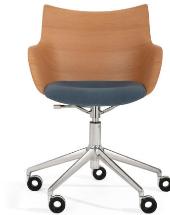
Shown in chrome legs / light wood veneer backrest / powder blue fabric seat

PRODUCT DIMENSIONS . . . . . Adjustable Seat Height: 14.57-19.69"