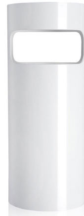
Shown in matte white

A classic of the Sixties, the multifunctional and indestructible Gino Colombini Umbrella Stand is an injection molded cylindrical container available in a variety of colors. With two side openings, it can also be used as a waste bin. Today, this product is made with a material derived from recycled industrial waste and with soft touch finish.