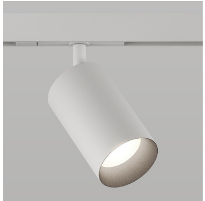
Shown in: White Powdercoat / Black Baffle

Provide accent lighting and highlight artwork, architectural details, and more with the CTM1 LED 120V Track Head. Designed for use with the TCS 120V Track system by Lucifer Lighting, the CTM1 Track Head is versatile and easy to adjust in-field. The track head can be rotated 370 degrees and tilted up to 60 degrees to direct light exactly where it is needed. A classic silhouette and powdercoat finish allow the CTM1 to seamlessly blend in to any space. May be used with Lucifer surface mount or recessed track. Required tracks and connectors are sold separately. Dimmable with ELV / Triac dimmers.