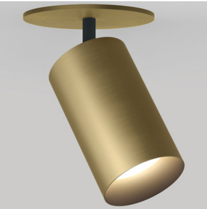
Shown in: Brushed Cast Brass / Black Baffle

The CM1 Adjustable Monopoint Spot Light offers excellent performance in a sleek, streamlined package. An innovative design with an elbow built into the fixture body allows the cylinder to be adjusted 90 degrees to direct the spotlight precisely where it is needed. Mounts to standard 4 inch junction box in remodel applications with surface canopy, or in new construction with canopy and flush mount junction box cover plate. Integral driver dimmable with ELV / Triac dimmer. Includes soft focus lens.