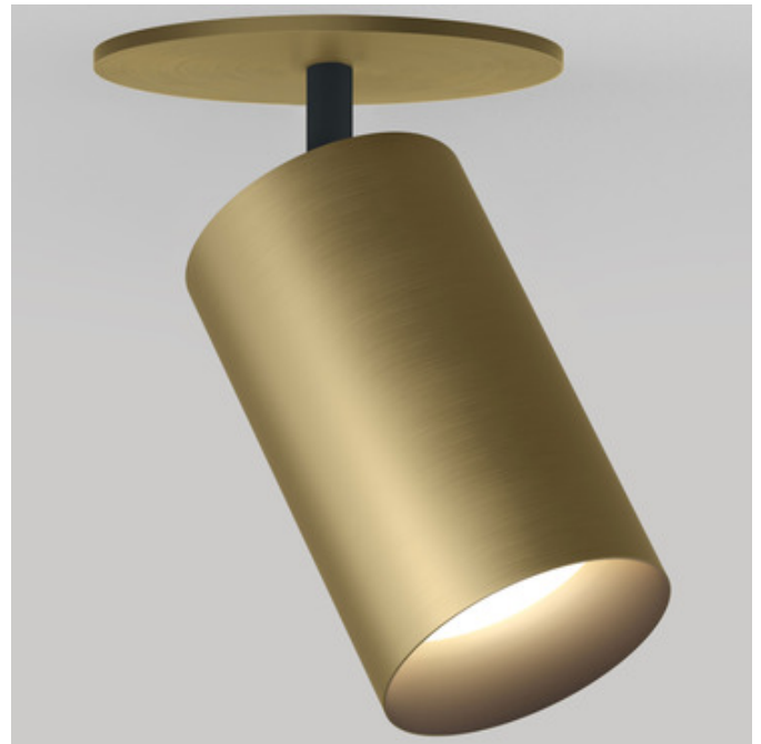
Shown in: Brushed Cast Brass / Black Baffle

The CM1 Adjustable Monopoint Spot Light offers excellent performance in a sleek, streamlined package. An innovative design with an elbow built into the fixture body allows the cylinder to be adjusted 90 degrees to direct the spotlight precisely where it is needed. Can be mounted on wall or ceiling. Mounts to standard 4 inch junction box in remodel applications with surface canopy, or in new construction with 2.5 inch canopy and universal junction box mounting plate which attaches to junction box before ceiling substrate is installed. Integral driver dimmable with ELV / Triac dimmer. Includes soft focus lens. Note: Warm Dim color temperature available in 40 degree beam angle option only.