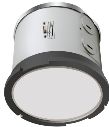
Shown in aluminum