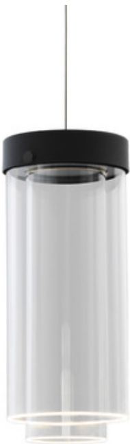
Shown in: Matte Black / Clear

The Ghost Pendant offers a sleek, minimalist design with an elegant expression. The pendant houses an integrated LED light source that shines downward through a pair of borosilicate glass cylinders and illuminates the rims to create the illusion of rings floating in air. Whether hung as a single pendant or arranged in a group of multiples, the Ghost will create a striking display in any space. Note: Includes a remote 24V XLG constant current driver which must be placed in a remote accessible location near the pendant.