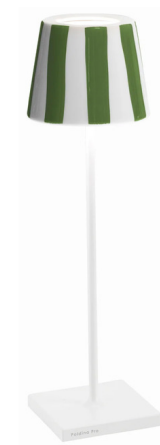
Shown in white / white / green stripes

COLOR RENDERING . . . . . 80 CRI LAMP COLOR . . . . . CCT Select LUMENS/WATT . . . . . 116.36 LUMINOUS FLUX . . . . . 256 lumens