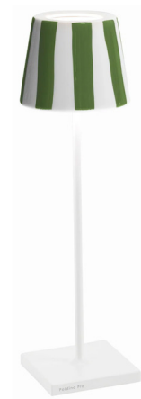
Shown in white / white / green stripes

COLOR RENDERING . . . . . 80 CRI LAMP COLOR . . . . . CCT Select LUMENS/WATT . . . . . 116.36 LUMINOUS FLUX . . . . . 256 lumens