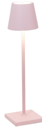
Shown in pink

COLOR RENDERING . . . . . 80 CRI LAMP COLOR . . . . . CCT Select LUMENS/WATT . . . . . 99.44 LUMINOUS FLUX . . . . . 179 lumens