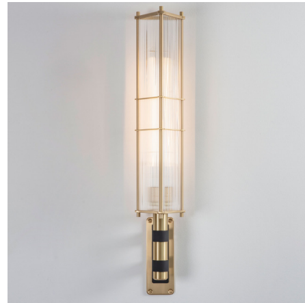
Shown in brushed brass / black

Inspired by the grandeur of Art Deco design, the Arbor Wall Sconce features an eye-catching linear form that will add a sophisticated accent to any space. Vertical acrylic rods run along the sides of the sconce to obscure the light source and create a warm, intimate glow. Whether installed on its own or in a pair flanking a doorway or bed, Arbor will make an eye-catching statement. Dimmable with TRIAC dimmers. Note: Includes mounting plate to cover standard 4 inch US junction box. Note: UL certification is available upon request for an additional charge. Please contact our sales team for assistance.