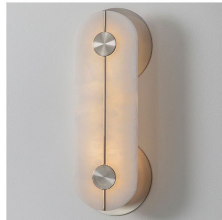
Shown in nickel / alabaster

LAMP COLOR . . . . . 2700K LUMENS/WATT . . . . . 90.00 LUMINOUS FLUX . . . . . 900 lumens