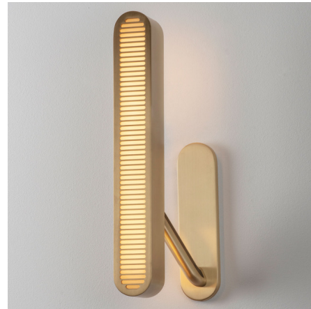
Shown in brushed brass / opal

The Colt Single Wall Sconce features a pure, linear design with an asymmetrical twist. This oblong wall sconce features gentle curves with an angled arm available in left or right orientations. An opal acrylic diffuser set behind the slotted grille reduces glare from the integrated LED and gives the piece a sleek, industrial vibe. Integrated LED driver dimmable with TRIAC dimmers. Note: Includes mounting plate to cover standard 4 inch US junction box. Note: UL certification is available upon request for an additional charge. Please contact our sales team for assistance.