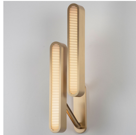
Shown in brushed brass / opal

The Colt Double Wall Sconce features a pair of machined brass grilles at offset heights supported by sleek angled arms. An opal acrylic diffuser set behind each grille reduces glare from the integrated LEDs and gives the piece a sleek, industrial vibe. Integrated LED driver dimmable with TRIAC dimmers. Note: Includes mounting plate to cover standard 4 inch US junction box. Note: UL certification is available upon request for an additional charge. Please contact our sales team for assistance.