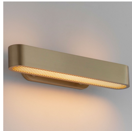
Shown in brushed brass

The Colt Horizontal Wall Sconce features a sleek, sophisticated design that will complement both elegant modern and casual industrial spaces alike. The sconce houses an integrated LED light source that casts light both upward and downward through a slotted diffuser. Integrated LED driver dimmable with TRIAC dimmers. Note: Includes mounting plate to cover standard 4 inch US junction box.