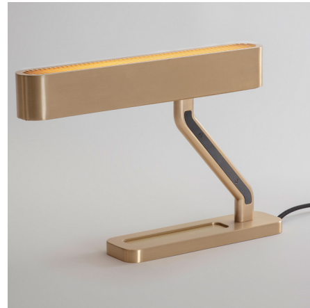
Shown in brushed brass

The Colt Table Lamp features a sleek, sophisticated design that will complement both elegant modern and casual industrial spaces alike. An angled stem supports the integrated LED light source that casts light both upward and downward through a slotted brass diffuser. The slim base also holds a shallow tray, which can be used to hold pens or other essentials on a desktop. On/off switch located on cord. Note: UL certification is available upon request for an additional charge. Please contact our sales team for assistance.