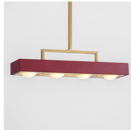
Shown in brass / oxblood

The Kernel Linear Pendant is defined by its clean, linear design and repetition of simple, geometric shapes. A row of opal glass globes provide a contrasting shape to the pendant's rectangular frame and direct light both up and downwards. The bottom of the pendant is covered by a laser cut brass diffuser, with curved slots echoing the globes' curves. Note: Includes mounting plate to cover standard 4 inch US junction box. Overall height to be specified at time of order.