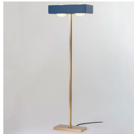
Shown in brass / blue

The Kernel Floor Lamp is defined by its clean, linear design and repetition of simple, geometric shapes. A pair of opal glass globes provide a contrasting shape to the lamp's rectangular frame and direct light both up and downwards. The bottom of the lampshade is covered by a laser cut brass diffuser, with curved slots echoing the globes' curves. On/off switch located on cord. Note: UL certification is available upon request for an additional charge. Please contact our sales team for assistance.