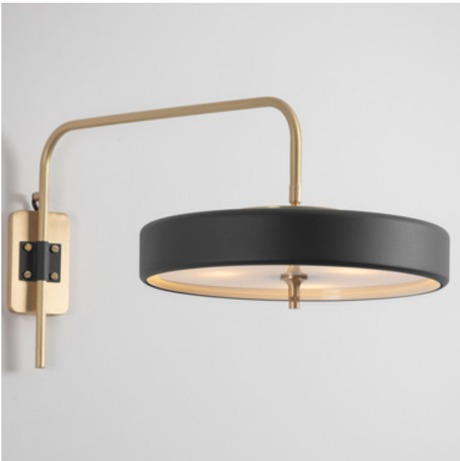
Shown in: Brushed Brass / Black

The Revolve Wall Sconce is a versatile fixture with a sleek, modern aesthetic that will complement virtually any interior. The slim, spun metal lampshade is accented by a polycarbonate diffuser to reduce glare and a brass reflector which directs light upward. The swinging arm can be angled up to 90 degrees from the wall to provide lighting precisely where it is needed. Note: Includes mounting plate to cover standard 4 inch US junction box.