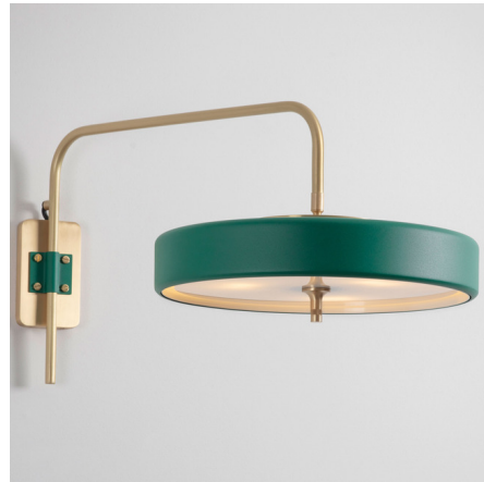
Shown in brushed brass / green

The Revolve Wall Sconce is a versatile fixture with a sleek, modern aesthetic that will complement virtually any interior. The slim, spun metal lampshade is accented by a polycarbonate diffuser to reduce glare and a brass reflector which directs light upward. The swinging arm can be angled up to 90 degrees from the wall to provide lighting precisely where it is needed. Note: Includes mounting plate to cover standard 4 inch US junction box. Note: UL certification is available upon request for an additional charge. Please contact our sales team for assistance.