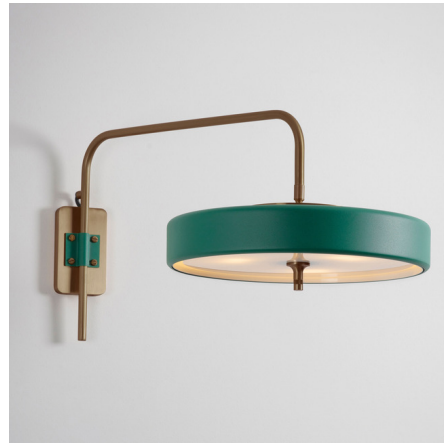
Shown in antique brass / green

The Revolve Wall Sconce is a versatile fixture with a sleek, modern aesthetic that will complement virtually any interior. The slim, spun metal lampshade is accented by a polycarbonate diffuser to reduce glare and a brass reflector which directs light upward. The swinging arm can be angled up to 90 degrees from the wall to provide lighting precisely where it is needed. Note: Includes mounting plate to cover standard 4 inch US junction box.