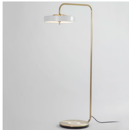
Shown in brushed brass / white

The Revolve Floor Lamp is a versatile fixture with a sleek, modern aesthetic that will complement virtually any interior. The slim, spun metal lampshade is accented by a polycarbonate diffuser to reduce glare and a brass reflector which directs light upward. A slim, curved brass stem supports the lampshade and allows it to be tilted up and down to aim the light. On/off switch located on cord. Note: UL certification is available upon request for an additional charge. Please contact our sales team for assistance.