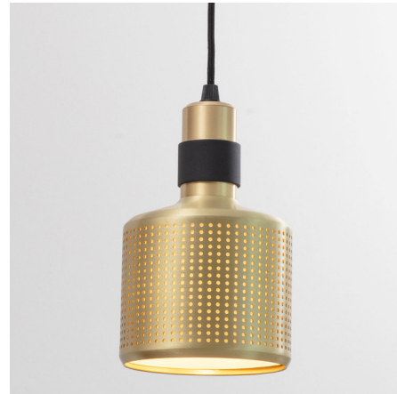
Shown in brushed brass / black

COLOR RENDERING . . . . . 80 CRI LAMP COLOR . . . . . 2700K LUMENS/WATT . . . . . 62.50 LUMINOUS FLUX . . . . . 250 lumens