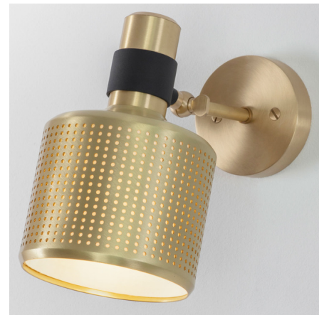
Shown in brushed brass / black

The Riddle Wall Sconce pairs a perforated, machined brass shade with an interior fabric diffuser for a sleek, industrial aesthetic that provides warm, soft light. The lampshade is cylindrical at the bottom before steeply tapering to a narrow stem. The sconce is supported by a round backplate and sleek stem with a hinged joint which allows the sconce to be tilted up and down to aim the light. Note: Includes mounting plate to cover standard 4 inch US junction box.