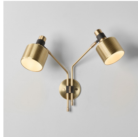
Shown in brushed brass / black

The Riddle Double Wall Sconce features a pair of perforated, machined brass shades with interior fabric diffusers for a sleek, industrial aesthetic that provides warm, soft light. The cylindrical lampshades are supported by angled brass arms with hinged joints, allowing the shades to be tilted up and down to aim the light. Note: Includes mounting plate to cover standard 4 inch US junction box.