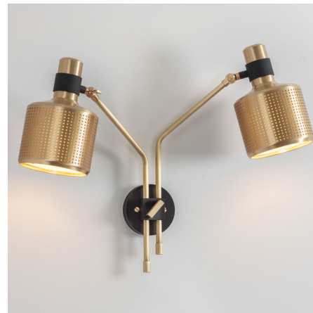
Shown in brass

The Riddle Double Wall Sconce features a pair of perforated, machined brass shades with interior fabric diffusers for a sleek, industrial aesthetic that provides warm, soft light. The cylindrical lampshades are supported by angled brass arms with hinged joints, allowing the shades to be tilted up and down to aim the light. Note: Includes mounting plate to cover standard 4 inch US junction box. Note: UL certification is available upon request for an additional charge. Please contact our sales team for assistance.