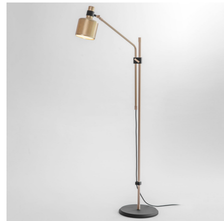
Shown in brass

The Riddle Floor Lamp pairs a perforated, machined brass shade with an interior fabric diffuser for a sleek, industrial aesthetic that provides warm, soft light. The lampshade is supported by an angled stem with a hinged joint that allows the light to be tilted up and down. The arm can also be rotated by loosening the knob on the lamp's stem. On/off switch located on cord.