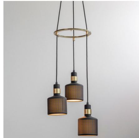
Shown in black / brushed brass

The Riddle Multi Light Pendant features a cluster of perforated brass pendants suspended from a circular spreader plate. Each pendant is lined with a fabric diffuser insert to reduce glare and produce a soft, warm glow. Suspending the pendants at varying heights creates an eye-catching sculptural form, which is enhanced by interplay of light as it emerges from the bottom and sides of the shades. Includes canopy to cover standard US junction box.