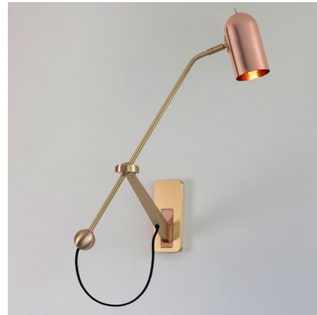
Shown in brushed brass / copper

The Stasis Wall Sconce combines form and function with a sleek, eye-catching design. The adjustable brass arm is capped by a dome shaped lampshade available in Copper or Bronze finish. The shade can also be tilted to further aim the light precisely where it is needed. On/off switch located on top of lampshade. Includes mounting plate for 4 inch US junction box (not pictured).