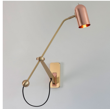
Shown in brass / copper

The Stasis Wall Sconce combines form and function with a sleek, eye-catching design. The adjustable brass arm is capped by a dome shaped lampshade available in Copper or Bronze finish. The shade can also be tilted to further aim the light precisely where it is needed. On/off switch located on top of lampshade. Note: UL certification is available upon request for an additional charge. Please contact our sales team for assistance.