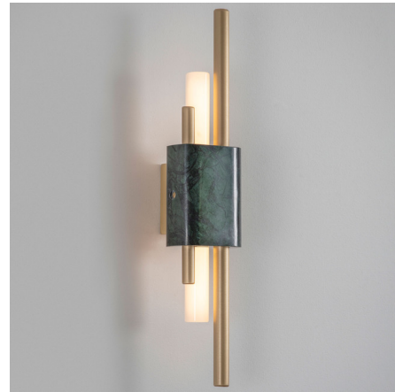
Shown in green marble / brass

The Tanto Wall Sconce combines a boldly modern silhouette with the age-old materials of brass, marble, and glass to create a striking, dynamic fixture. The light source is housed within an opal glass cylinder with decorative brass rods and a chunk of polished marble adding an opulent accent. The slim, asymmetrical design is a perfect fit for any modern interior. Includes mounting plate to cover standard 4 inch US junction box. Note: UL certification is available upon request for an additional charge. Please contact our sales team for assistance.