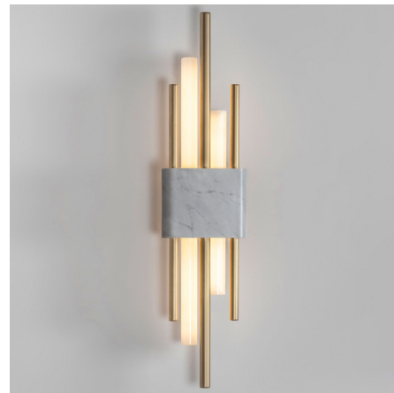
Shown in white marble / brushed brass

The Tanto Double Wall Sconce combines a boldly modern silhouette with the age-old materials of brass, marble, and glass to create a striking, dynamic fixture. The light sources are housed within a pair of opal glass cylinders with decorative brass rods and a chunk of polished marble adding an opulent accent. The slim, asymmetrical design is a perfect fit for any modern interior. Includes mounting plate to cover standard 4 inch US junction box. Note: UL certification is available upon request for an additional charge. Please contact our sales team for assistance.