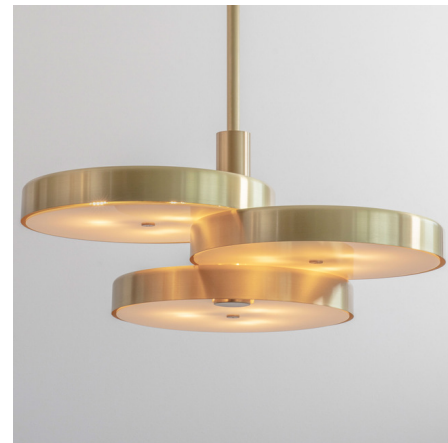
Shown in brass / opal

The Triarc Pendant is composed of three overlapping brass discs suspended from a single drop rod. The bottom of each disc is covered with an Opal or Black acrylic diffuser to reduce glare and softly disperse light. Triarc possesses a sculptural presence that will stand out in any interior, especially in a grouping of multiple pendants at various heights. Includes canopy to cover standard US junction box. Note: Overall height to be specified at time of order.