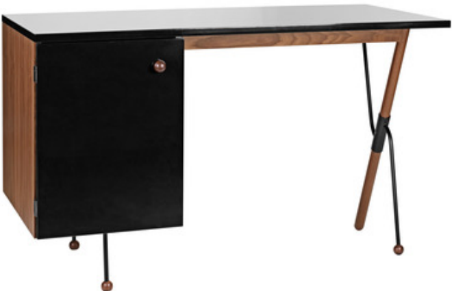
Shown in: Black / Walnut

DESCRIPTION Originally conceived in 1952 by Swedish designer Greta M. Grossman, the 62 Desk received its name as it was considered to be ten years ahead of its time. The desk is constructed from walnut veneer, glossy black laminate, and powder coated steel, an elegant pairing of materials that emphasizes the desk's asymmetric form. 62's legs are capped with walnut orbs that provide a geometric visual accent.