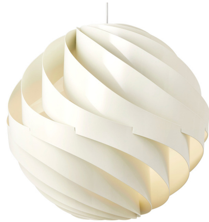
Shown in white / alabaster white

Originally designed in the mid-1960s by Louis Weisdorf, the Turbo Pendant was conceived as a modern update to traditional Japanese paper lanterns. Simple in shape but complex in structure, the pendant is constructed of swirling lacquered aluminum bands that shield the light source in order to reduce glare and provide diffused, ambient illumination. Turbo's timeless design will complement both retro and modern interiors alike.