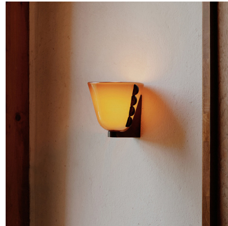
Shown in blackened brass / tobacco with ink embellishments

The Calla Wall Sconce uses a combination of rich colors with a romantic silhouette to create a one-of-a-kind piece. It features a handblown Glass shade decorated with rounded Glass fins whose colors deepen when illuminated. Due to the handmade nature of this product, all dimensions are approximate. Available with a square Brass backplate or with a Mudring kit.