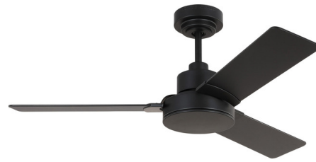
Shown in midnight black / midnight black / american walnut

The Jovie Ceiling Fan features a simple industrial design that works well in a range of spaces from transitional to contemporary. For fans that have a light, the color temperature (CCT) can be adjusted to 2700, 3000K, or 4000K using a switch on the light kit. A wall control is included and can turn the motor on/off and set 4 speeds. Fan direction can be reversed using a switch on the fan. If the fan has a light, the control also turns the light on/off and dims. Optional controls and accessories are sold separately.