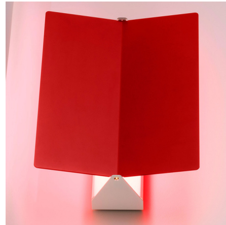
Shown in white / red

The Applique a Volet Pivotent Plie LED Wall Light features an adjustable aluminum shade that can be tilted to adjust the beam and intensity of the light. The fixture's design is indicative of Charlotte Perriand's concept of useful forms, which often incorporated minimalist designs with simple shapes.