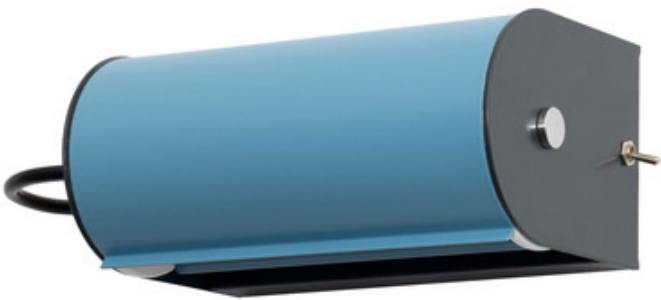
Shown in: Anthracite / Light Blue

The Applique Cylindrique Wall Sconce was originally designed by Charlotte Perriand for her mountain chalet in the early 1930s. Perriand's interest in useful forms is reflected in the fixture's moveable shade, which allows the direction and intensity of the light beam to be easily adjusted. The Applique Cylindrique's timeless design will complement both modern and retro-inspired interiors. Includes mounting plate for standard US junction box.