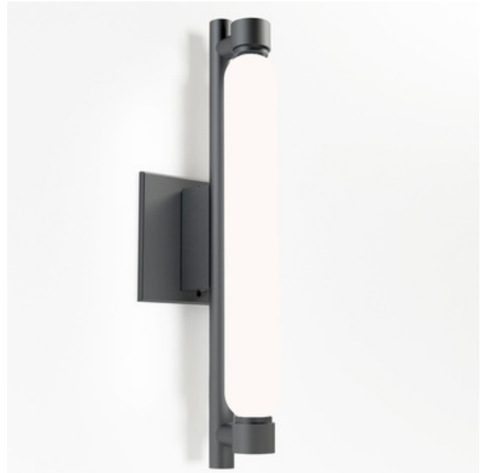
Shown in: Matte Grey / Opal

The La Roche Wall Lamp was the first wall lamp designed by iconic French architect and designer Le Corbusier. Originally created specifically for the Villa La Roche in Paris, Nemo has updated this classic design for the modern age with an integrated LED light source. The light is housed within an opal glass diffuser that softly disperses light. Includes mounting plate for US junction box.