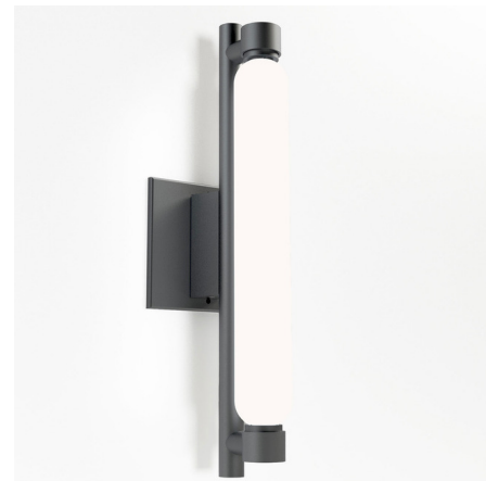
Shown in matte grey / opal

The La Roche Wall Lamp was the first wall lamp designed by iconic French architect and designer Le Corbusier. Originally created specifically for the Villa La Roche in Paris, Nemo has updated this classic design for the modern age with an integrated LED light source. The light is housed within an opal glass diffuser that softly disperses light. Includes mounting plate for US junction box.