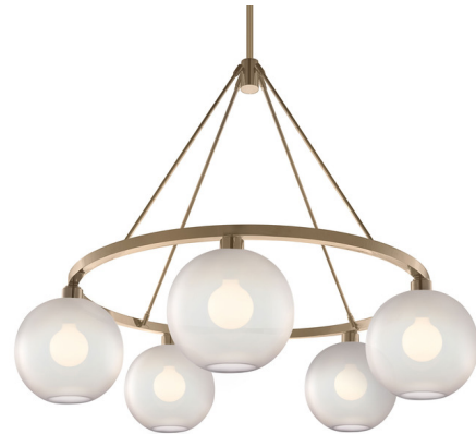
Shown in satin brass / opaline