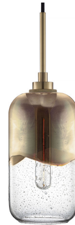
Shown in satin brass / mercury / effervescent

COLOR RENDERING . . . . . 90 CRI LAMP COLOR . . . . . 2200K LUMENS/WATT . . . . . 80.00 LUMINOUS FLUX . . . . . 160 lumens