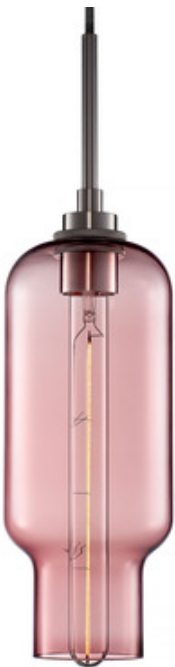
Shown in: Polished Nickel / Fig

The Pharos LED Pendant, designed by Jeremy Pyles, pays homage to ancient towers of light with its sleek and simple design crafted from handblown glass. It takes its name and shape from the Lighthouse of Alexandria, also known as the Pharos, which gave warning of shoals to passing ships. Includes LED retrofit bulb, 48 inch cord, and 5 inch diameter canopy. Note: The Sapphire shade is not available with Satin Brass hardware. The Plum shade is not available with Graphite or Polished Nickel hardware. The Fig and Moss shades are not available with Black hardware.